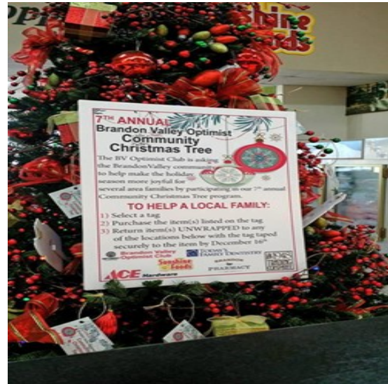
Brandon Valley Community Christmas Tree