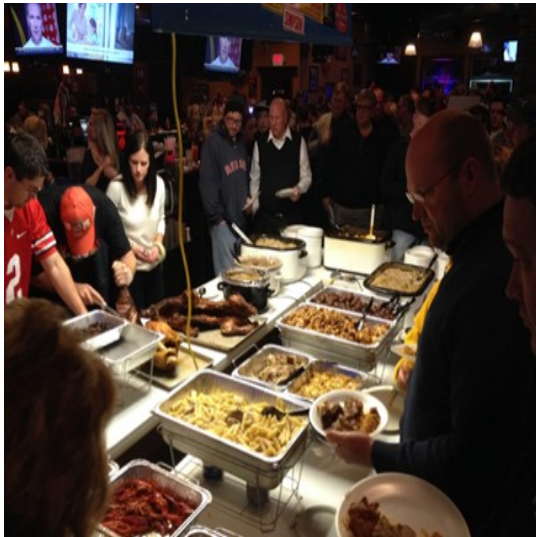
Brandon Valley Wild Game Feed